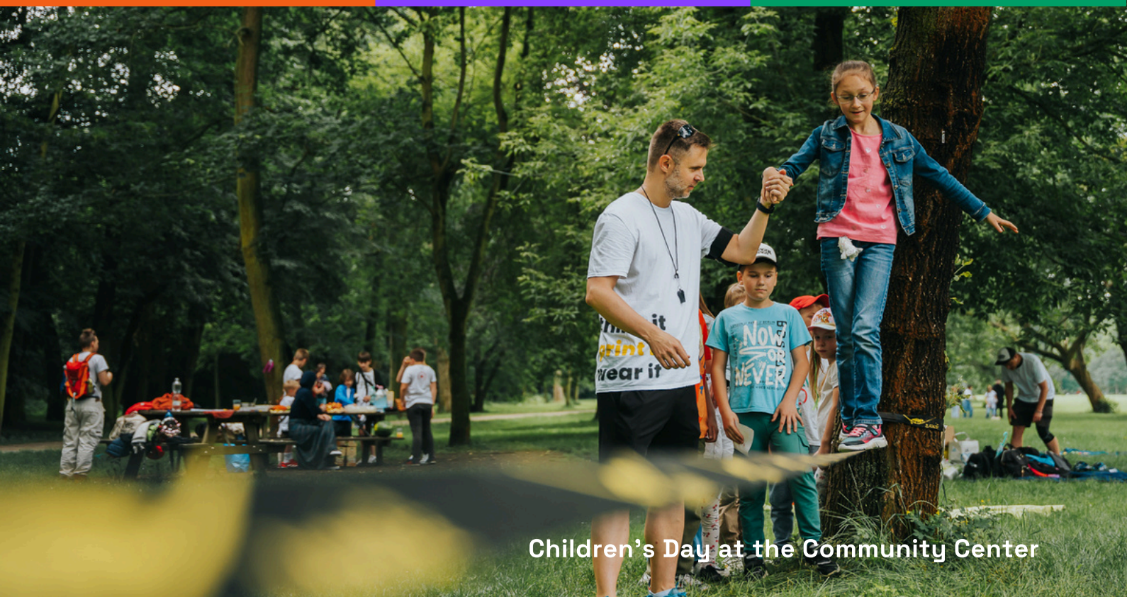
Children's Day at the Community Center

The project is intended for foreigners from third countries. The aim of the project is to equalize opportunities for integration into the labor market for 200 members of the target group through education, mentoring, coaching, individual counseling, and supplementary tools. We offer support in finding employment, educational activities in the form of Czech language courses, assistance in finding retraining courses, and assistance in the recognition of foreign qualifications. The project is implemented at branches in Prague, Plzeň, Hradec Králové, Ostrava, and Brno.