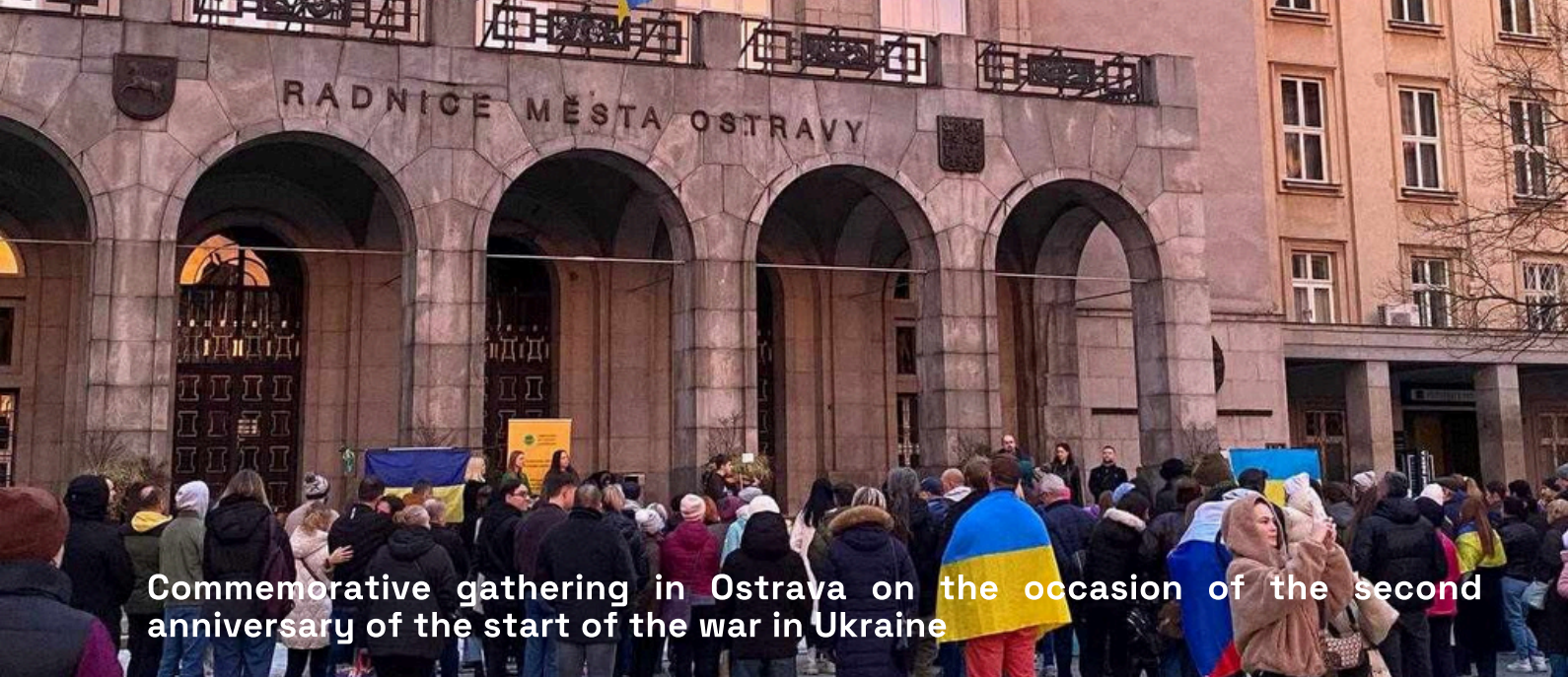
Commemorative gathering in Ostrava on the occasion of the second anniversary of the start of the war in Ukraine