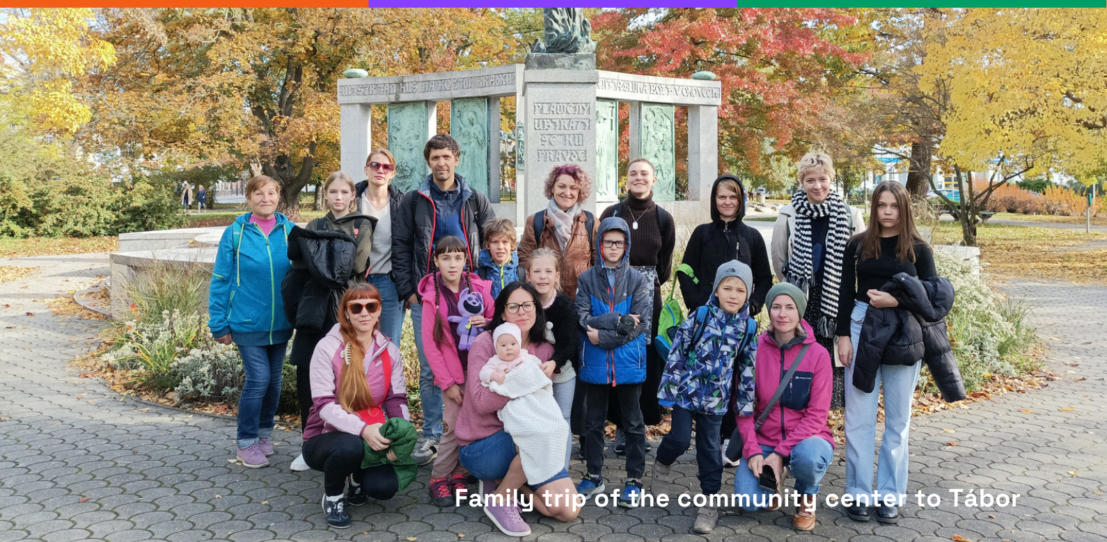
Family trip of the community center to Tábor

The aim of the project was to provide legal assistance to the most vulnerable refugees from Ukraine and other countries.