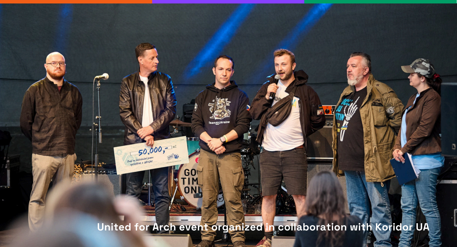
United for Arch event organized in collaboration with Koridor UA

Support for the development of OPU employees, support for OPU legal and social counseling, support for the Ukrainian senior citizens' club.