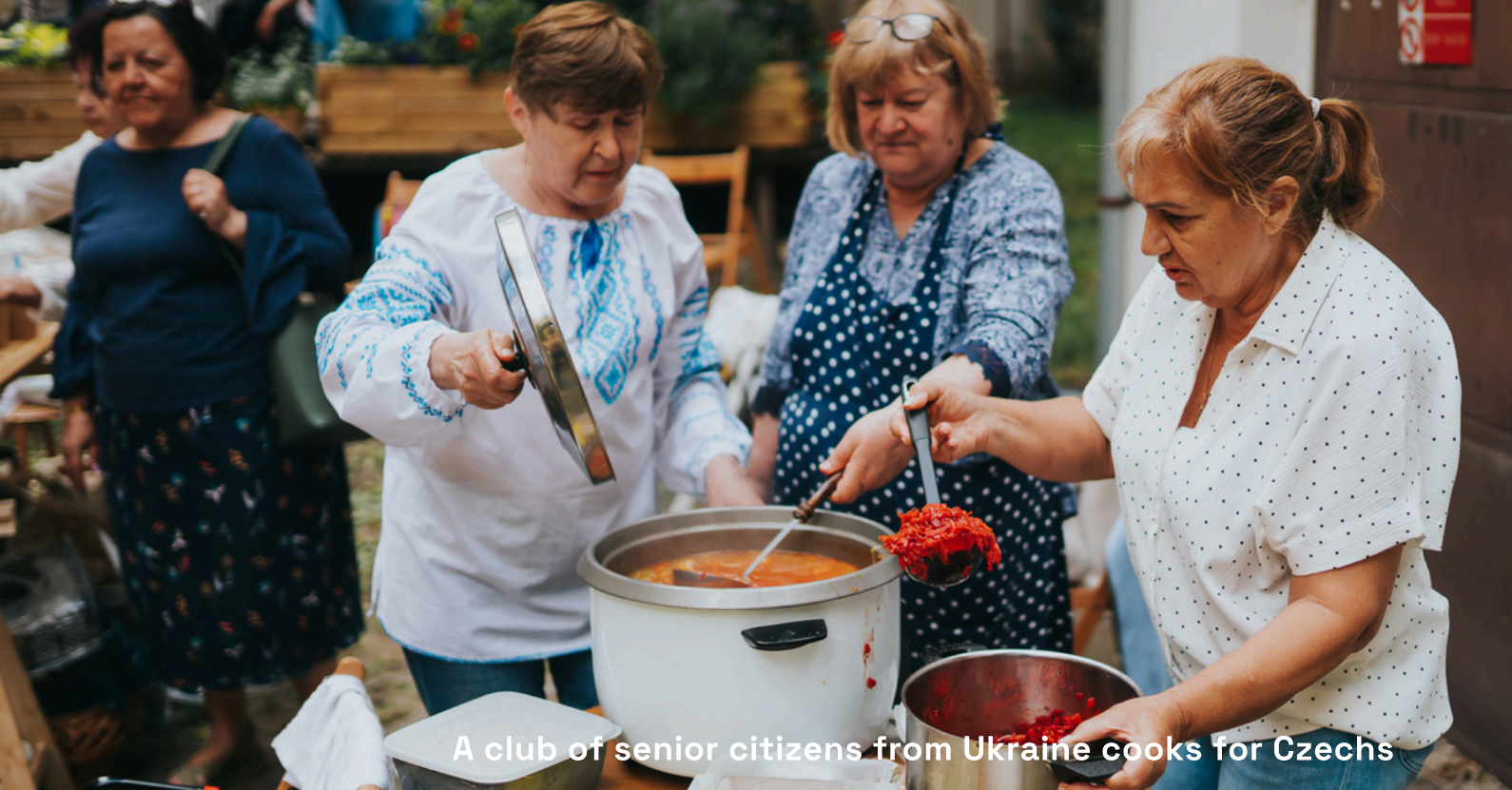
A club of senior citizens from Ukraine cooks for Czechs